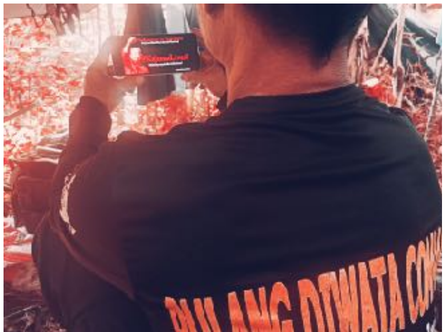
A Red fighter in Northeast Mindanao receives news of Ka Joma's passing

The limits of US imperialist power have been exposed by its failure to take over the oil resources and build 16 military bases in Iraq, to destroy the Syria-Russia-Iran alliance, to break the revolutionary struggle of the Turkish and Kurdish people and to hold on to Afghanistan surrendering